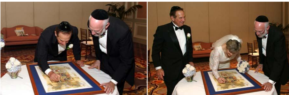
Our contract for life – Signing the Ketubah