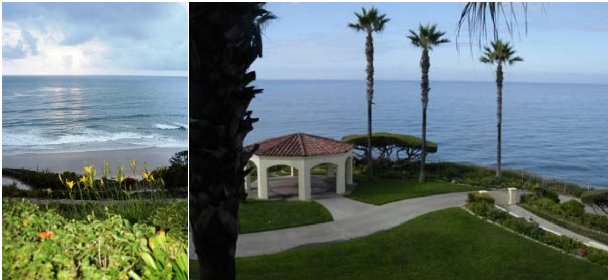
Views from the Ritz in Laguna Beach