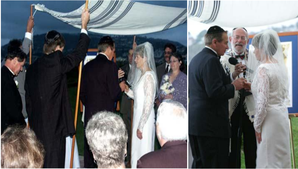
The commitment – finally after 35 years together