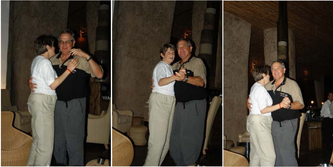
In a few seconds our life will change